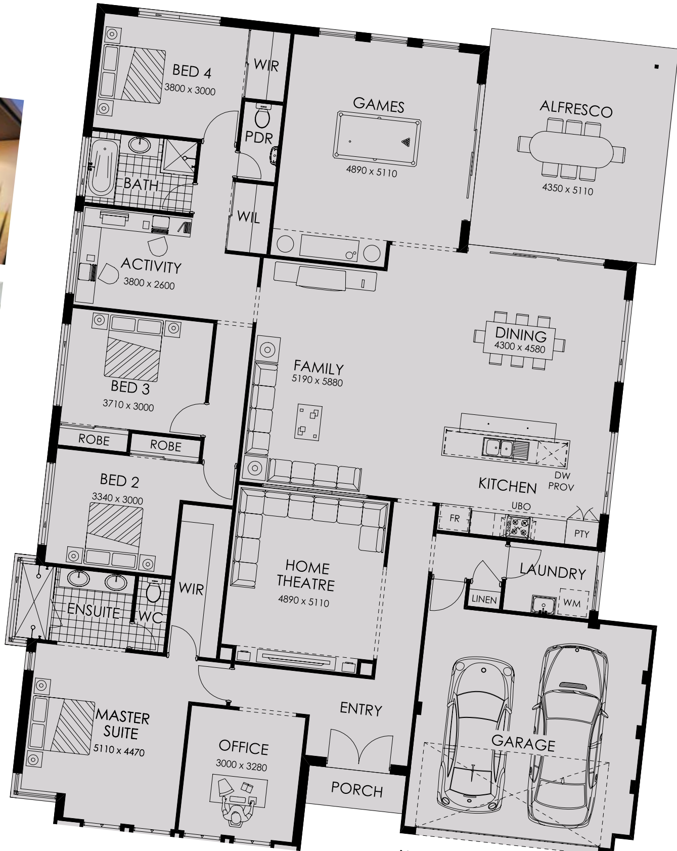
MODEL NO xxxx